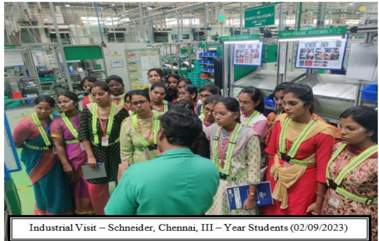
Industrial Visit – Schneider, Chennai, III – Year Students (02/09/2023)

Students from 3 rd semester EEE along with two faculty of our department were visited, “Schneider Electric” Chennai on September, 2023. The technical staff members taken the students to field and explained the operation of power transformer, circuit breaker, relays and lightning arrester. This visit is very much useful for the students.