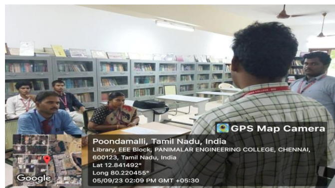
Poondamalli, Tamil Nadu, India Library, EEE Block, PANIMALAR ENGINEERING COLLEGE, CHENNAI, 600123, Tamil Nadu, India Lat 12.841492° Long 80.220455° 05/09/23 02:09 PM GMT +05:30