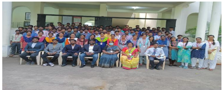
Workshop on "Electric and Hybrid Vehicles" conducted by Top Engineers (29/09/2022)