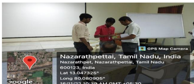
Department Activities Technical Event "Just a Minute" conducted on (16/11/2022)