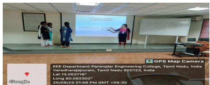
EEE Department Panimalar Engineering College, Tamil Nadu, India Varadharajapuram, Tamil Nadu 600123, India Lat 13.0522710° Long 80.082302° 25/09/23 01:56 PM GMT +05:30