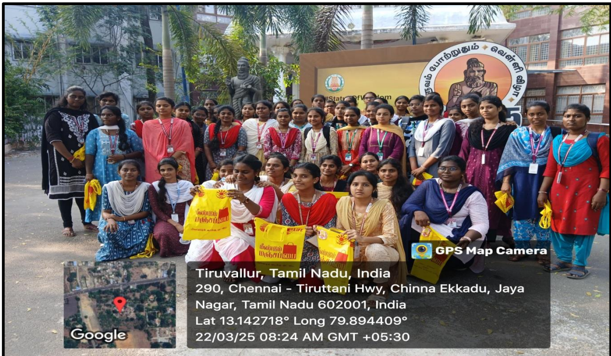
A group of students gathers for a photo after participating in the awareness event. They proudly display cotton bags promoting the avoidance of plastic.