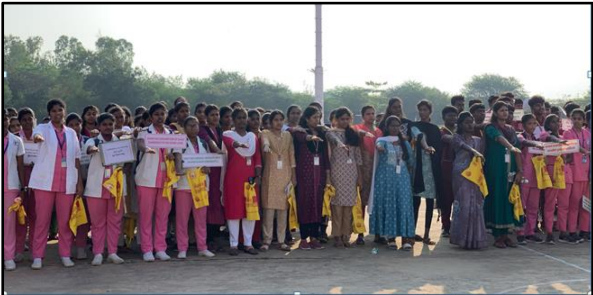
The pledge-taking ceremony included a recitation of the oath by NSS Volunteers following the District Collector.